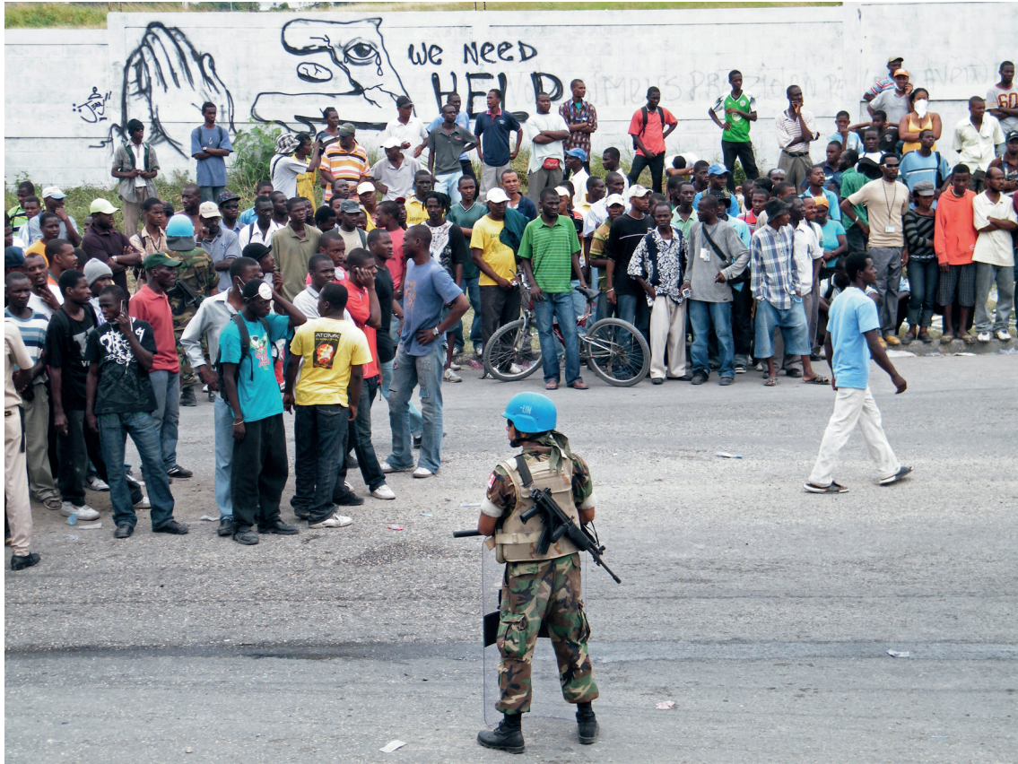
FIG. 5 – A United Nations peacekeeper watches over Haitians at an aid centre after an earthquake, January 2010. Writing on the wall behind them shows a pair of hands in prayer and says ‘We need help’.